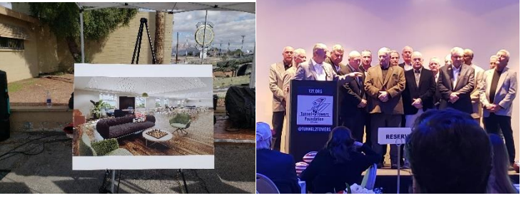
(Pic 3-Home for Veterans-TX facility; Pic 4-Social Area; Pic 5-NYC Firefighters-all 9/11 survivors)